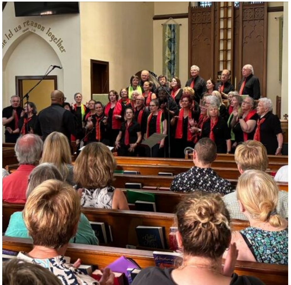
Gospellers concert in July